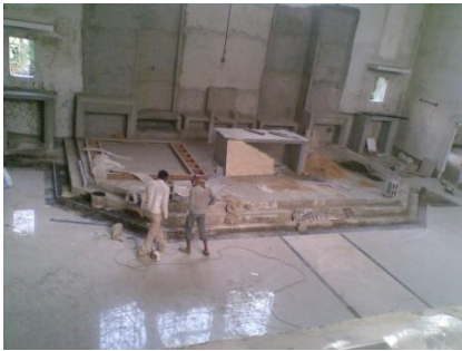
Tiles are being laid in St.Peter's Church, R,Bagh