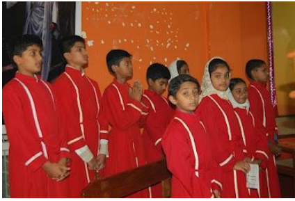
Altar Servers at St.Peter's Church (Rustambagh)